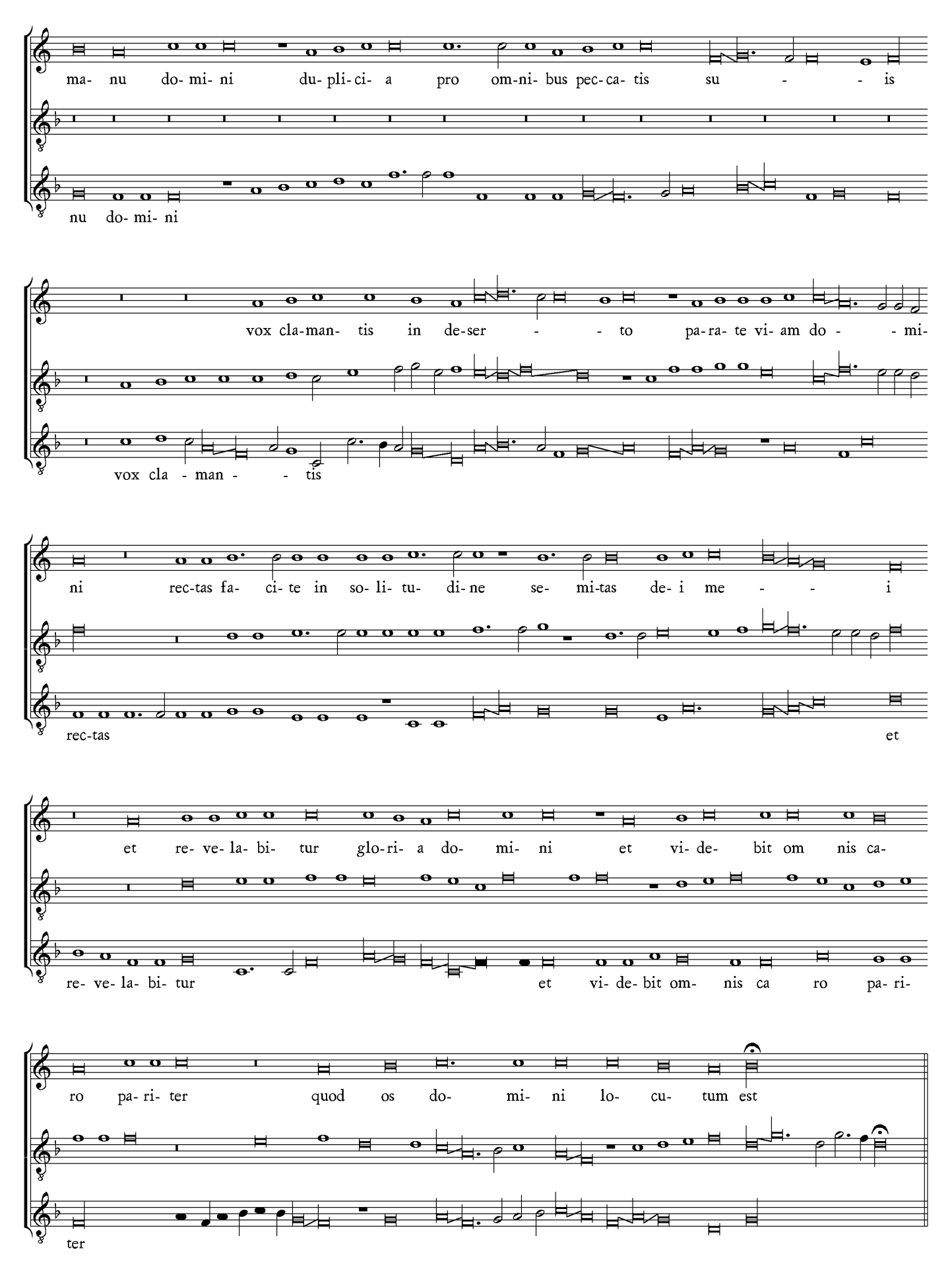
Anonymous – Trento - tr91 132v-133r